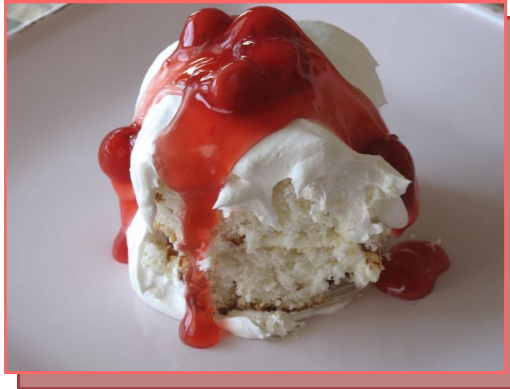
New light and refreshing dessert, Cherries in the Snow!!!

...to stop by and support the eatery managed and operated by Martin Enterprises in Martin General Hospital's lobby. We have new menu items featured below. Our new summer hours are Monday thru Thursday 9-4 and Friday 8-3. Follow us on Facebook at: www.facebook.com/hospitalitycorner